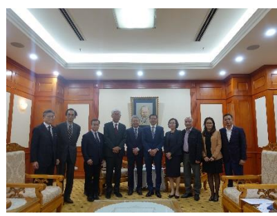
Ministry of Science and Technology (MOST)