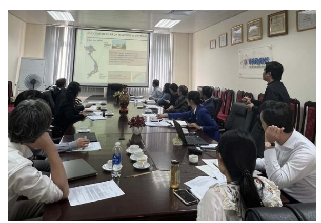
JICC-Vietnam Agency for Radiation and Nuclear Safety (VARANS) Seminar