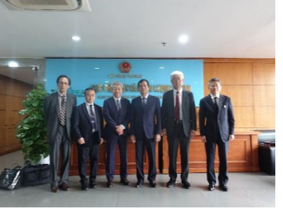
Ministry of Industry and Trade (MOIT)